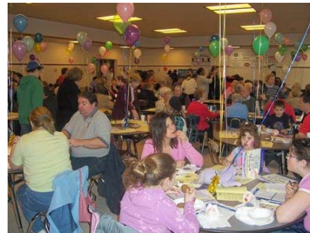
East Meadow Pancake Breakfast

Town Hall is looking forward to their Masquerade Ball which will be held on Friday May 19 th at 7:00 PM. The event will take place at Town Park at Lido Beach 630 Lido Blvd. The club is planning an evening of fun and fellowship with a meal, beer, wine, and soda. There will be prizes for best costume, and dancing. You get all this for only $50.00. For