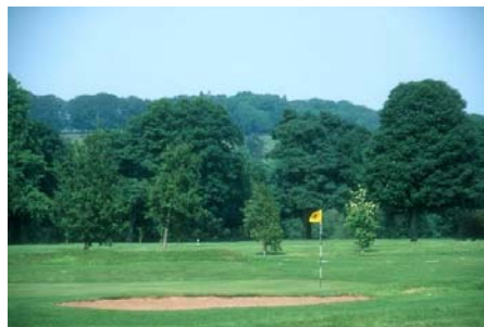
Wantagh and Massapequa members practice in small back yard