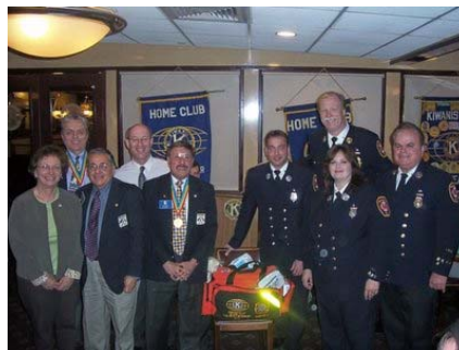
East Meadow Fire Dept. Rescue 5 receives KPTC Trauma Kit

Jun 28 th – Jul 2 nd Kiwanis International Convention will be held in Montreal Canada.