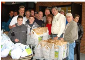
East Meadow members gather to deliver Passover/Easter baskets

Mon May 15 th 6:30 PM LISC Divisional Council at Per Un Angelo. This meeting will be hosted by the Town Hall and West Hempstead clubs.